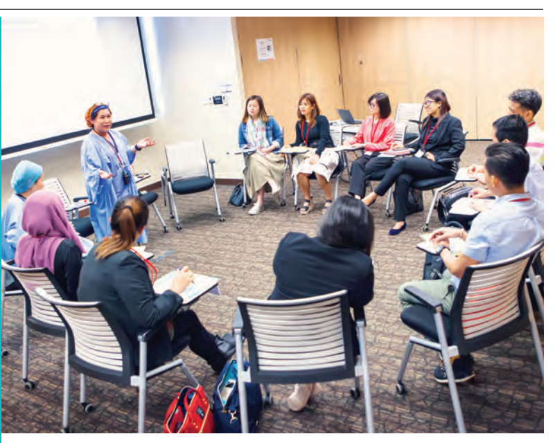
NHCS organises a Perfusionist Training & Learning Workshop once a vear to impart technological expertise and knowledge for fellow perfusionists in Singapore and across the region.

science or life sciences background. At NHCS, a trainee perfusionist will be assigned to a senior perfusionist who will guide him or her through the two-year on-the-job training, imparting both theoretical knowledge and practical skills. The progress of the trainee's training and development is characterised by several milestones: from the set-up of the heart-lung machine and management of the cardiopulmonary bypass procedure, to the operation of various accessory devices and equipment.